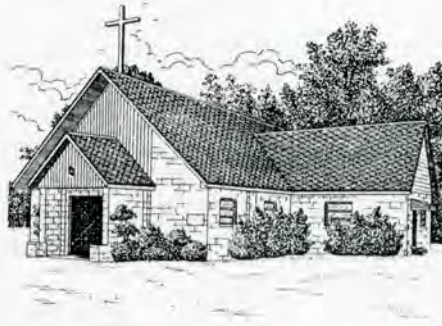
Pope's Chapel United Methodist Church