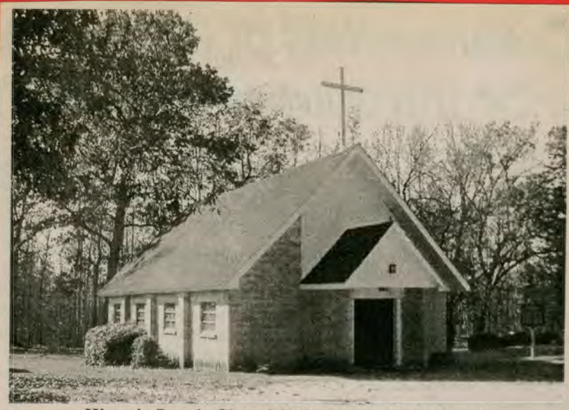
Historic Pope's Chapel United Methodist Church