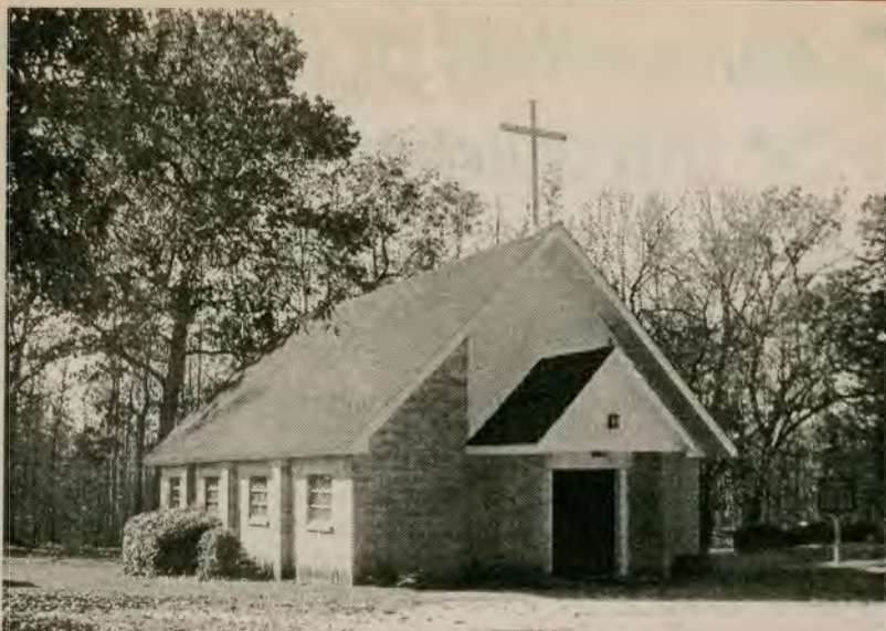
Historic Pope's Chapel United Methodist Church