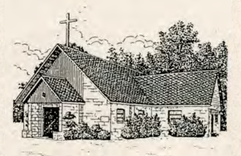
Pope's Chapel United Methodist Church