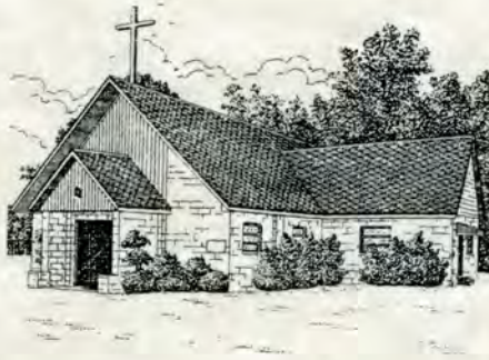
Pope's Chapel United Methodist Church