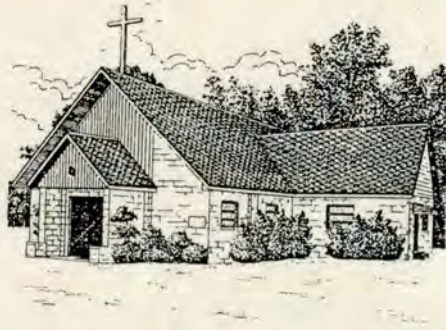
Pope's Chapel United Methodist Church