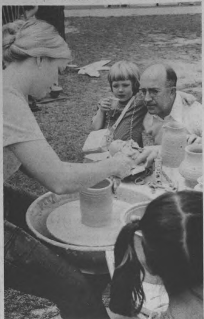
Spectators watch in wonder as one VSC art student demonstrates the potter's wheel.