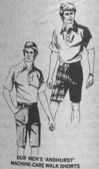
OUR MEN'S 'ANDHURST' MACHINE-CARE WALK SHORTS $9