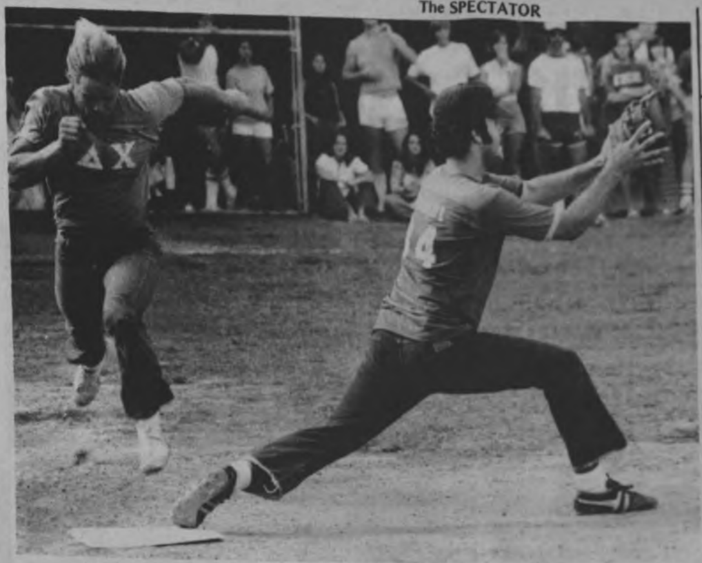
A close play in last week's all-important contest between TKE and Delta Chi.