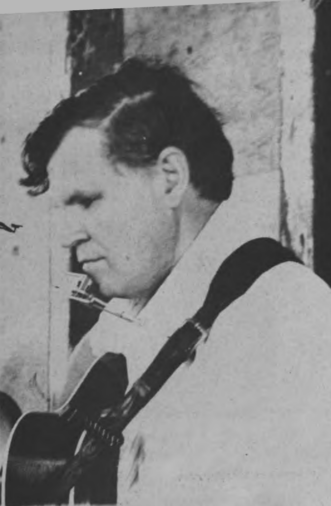
Doc Watson—Bluegrass Great

The next issue of Platten will unfortunately be the last. Since no new music is expected in the next couple of weeks, Platten will turn toward the actions of VSC's radio station, WVVS for a view on the events coming up in the summer quarter.