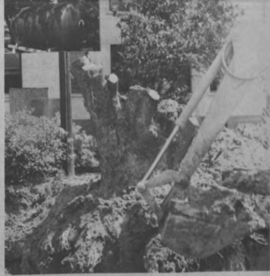
This May Stump You