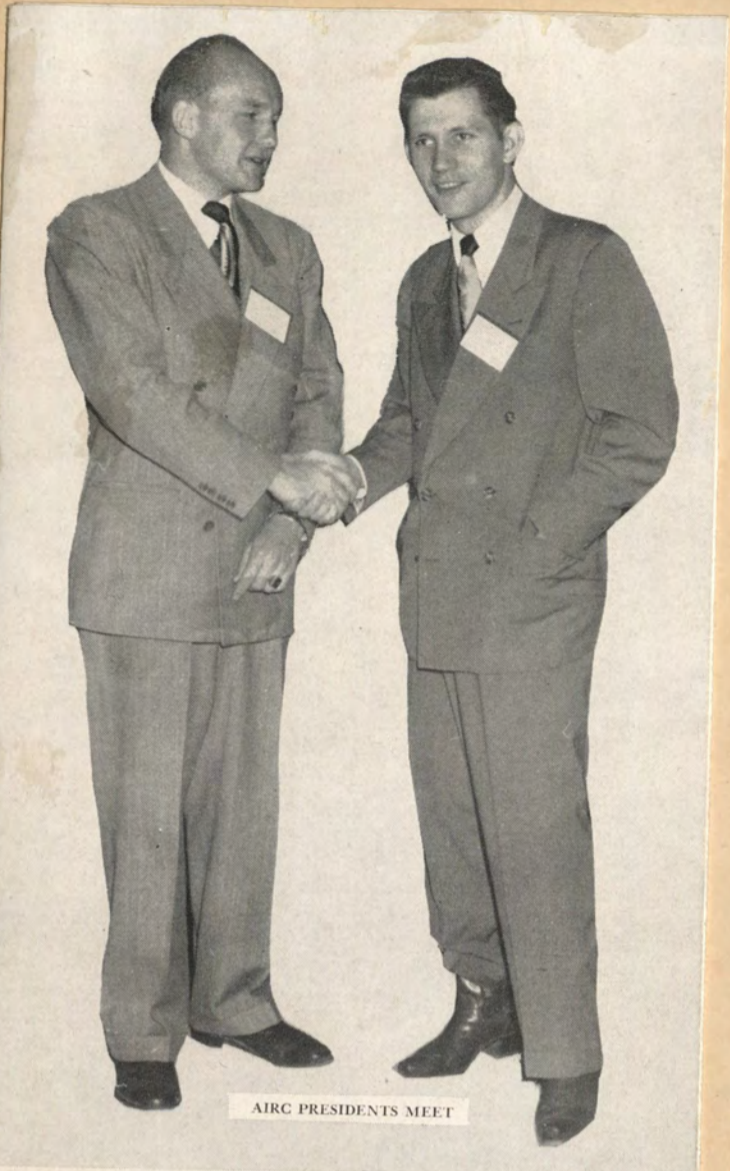
AIRC PRESIDENTS MEET

ASSOCIATION OF INTERNATIONAL RELATIONS CLUBS