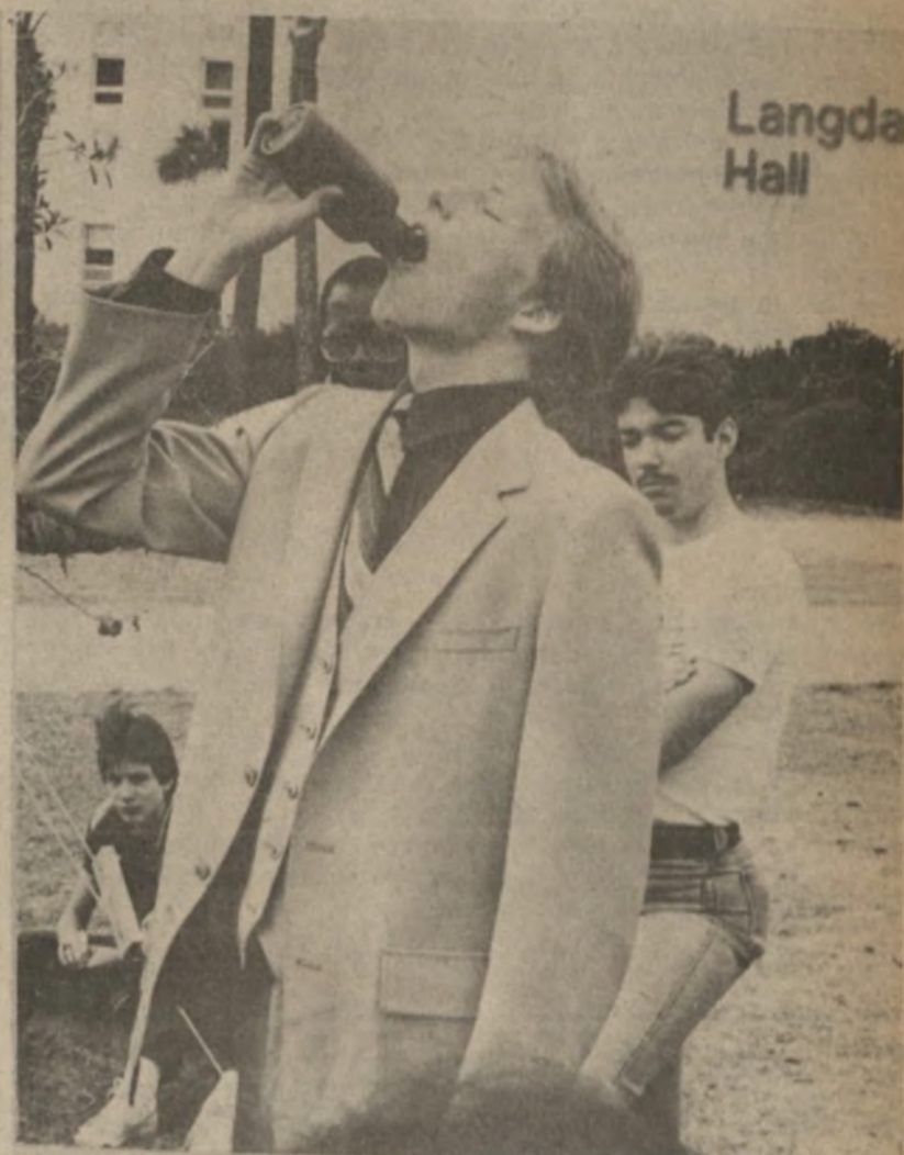
Takes a swig of "holy water" before passing judgement