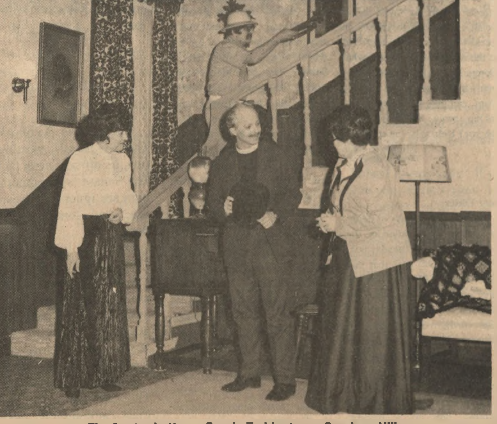
The Aunts chatter as Cousin Teddy storms San Juan Hill. *****************************

The Governor of the State of Georgia, the Honorable George Busbee, ordered thermostats set at no higher than sixty-five degrees Farenheit in state operated buildings beginning last Saturday and continuing until further notice. This measure is necessary to conserve fuel and electricity. No auxiliary or portable heaters are allowed to be used during this emergency caused by gas shortages.