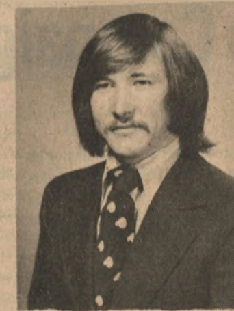
AN OPEN LETTER TO THE VD CLARION

I have just finished reading your article entitled the "Expansion Dilemma" and although it is described as being fictious and any situation that is similiar to it is coincidental, I must say that it is quite obvious to this reporter that the article was made against the proposed new sports complex of VSC. Just as you have an opinion which you are able to voice in the Clarion, I have one and harder to win games on the road. also which I use this column for.