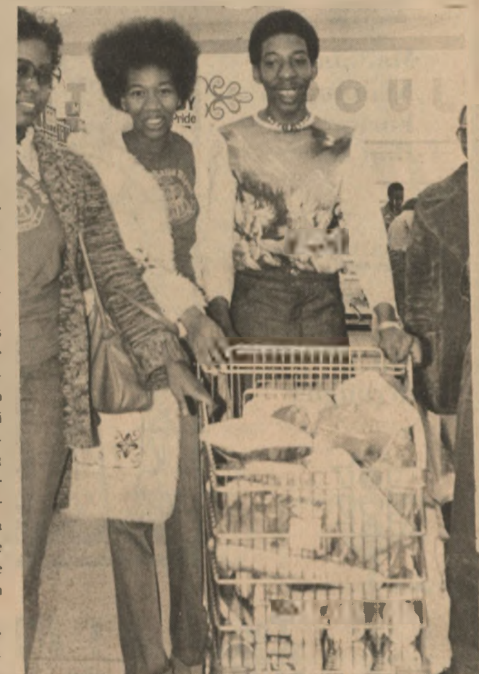
Some members of Alpha Kappa Alpha Sorority with the winner of their Shopping Spree Giveaway.