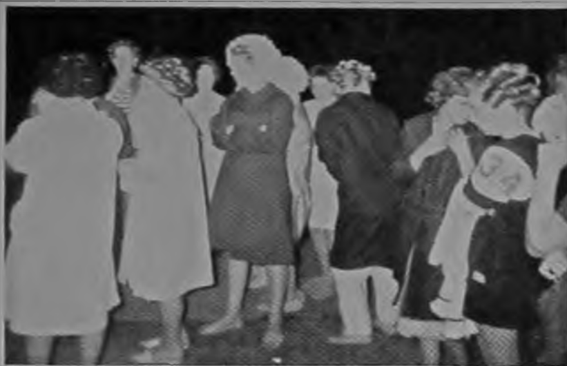
Caught by the photographer by surprise, these Reade dormitory girls await signal that all is clear and there really isn't a fire.

With Christmas rapidly approaching, many students are searching frantically for holiday jobs to add to their ailing bank accounts. However as quite a few would-be employees will tell you, openings are limited. Don't despair yet, if you are sound of mind and limb (which already eliminates some competition) you may scale the heights of trees for that cunning little parasite mistletoe. After obtaining the delightful specimens, you can always peddle mistletoe to men and maids to promote Christmas cheer. (Our students seem to be doing quite well with or without the greenery.)