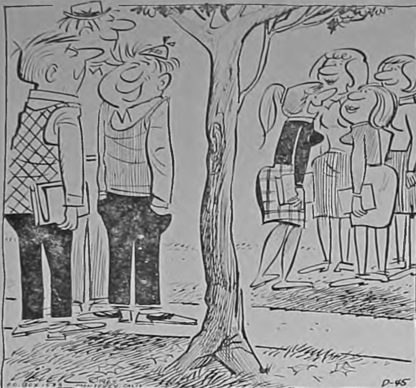
"—TH' DOLL IN THE BLACK SWEATER—FIRST DATE—A 'LD TIGRESS"