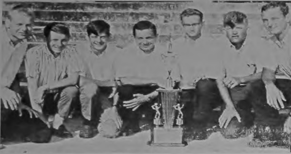
VSC Tennis Team Wins First GIAC Crown