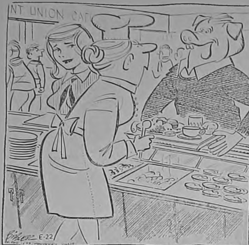
"I KNOW I'VE COMPLAINED A LOT ABOUT THE FOOD HERE BUT NOW THAT I'M ABOUT READY TO GRADUATE I'M BEGINNING TO LIKE IT."