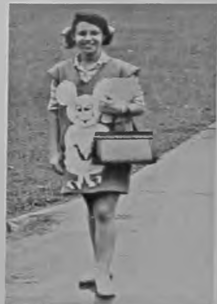
These VSC freshmen were two of the few of the rats who upheld the school tradition of wearing a crocus sack to school on Friday of rat week. At rat court on October 4, an SGA member estimated 95 out of 600 freshmen attended. We upper classmen appiaud these rats who have the right spirit about keeping the tradition alive.