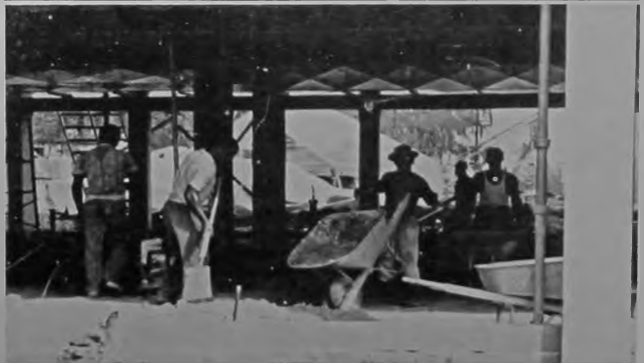
Rainy days of Autumn have somewhat slowed up construction on the VSC campus. But soon to be completed are a new men's dorm, women's dorm, student center, and academics building.