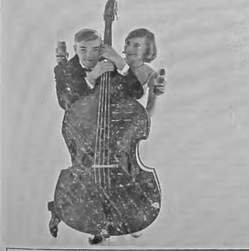
Take 5... and swing out refreshed.

Greeks Earn Money Kappa Delta pledges are having a carwash tomorrow at the C&S Bank from 9:00 to 5:30 at the extension on N. Patterson. Phi Mu's are holding a cake sale for the March of Dimes tomorrow.