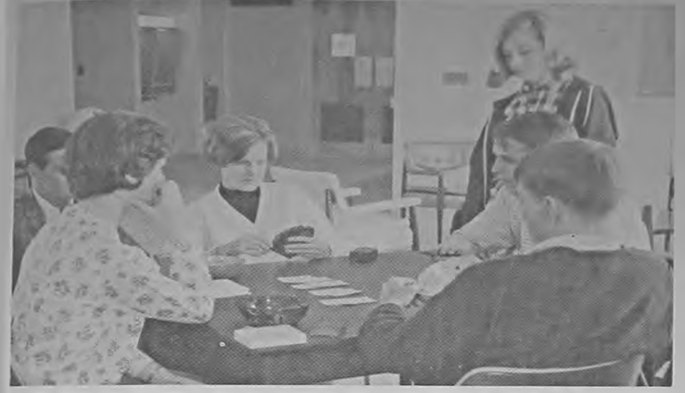
The first order of business after the freshmen girls moved into Hopper Hall was to get a bridge game going in the lounge. The dorm is open for the first time this quarter.