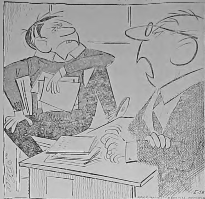
"Of course I can pass you on condition — on the condition you will never ever take a course from me again."