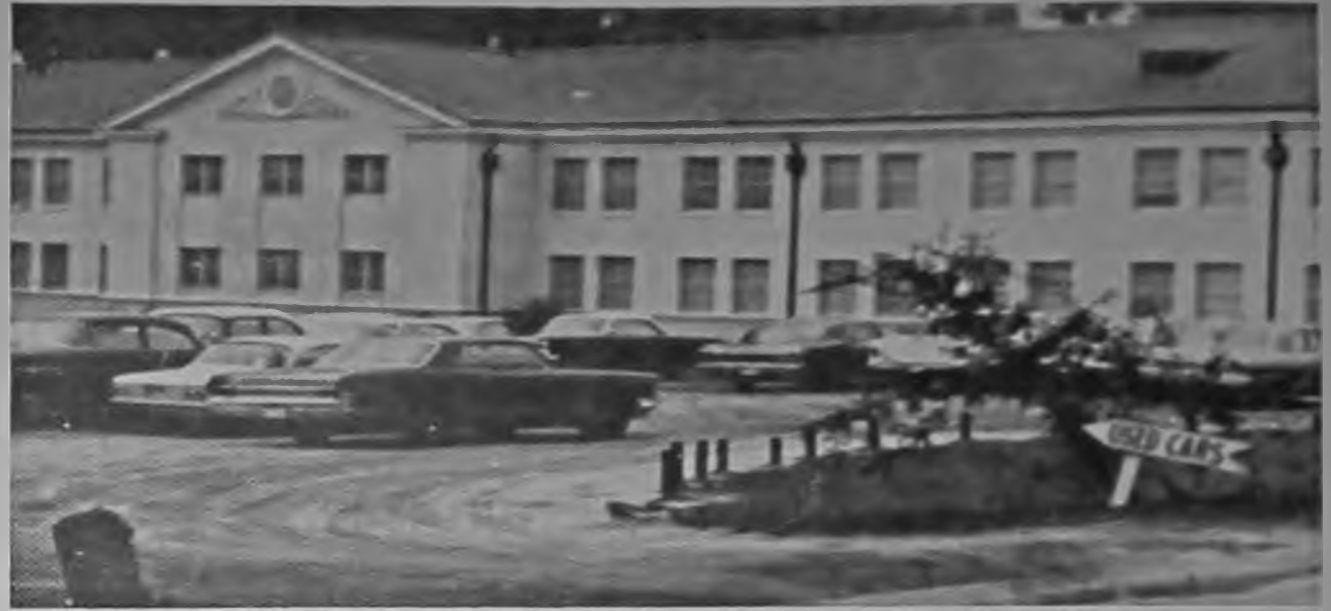
Many times witty VSC students have put "For Sale" signs on the front campus hoping some benevolent soul would buy the college. But this time one student hopes to make a killing selling good used cars at bargain prices. We don't know if there were any takers before the sign was removed.

The library loses a larger percentage of religious books than any other. But students steal