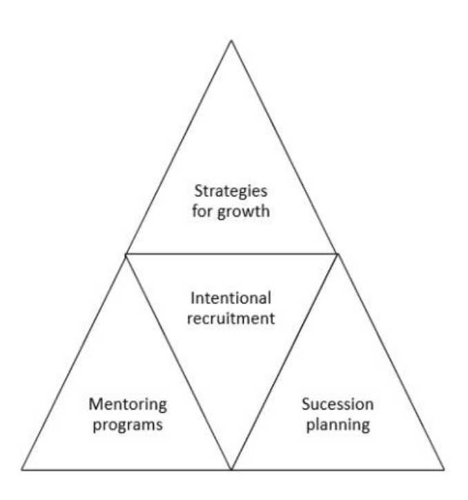
Figure 1. Strategies for Growing SLA Opportunities for Minority Women

Note . Taken from Webster, 2019, Enablers and barriers influencing African American administrators' career advancement at predominantly white institutions of higher learning. (Doctoral Dissertation).