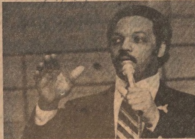
Jackson To Speak At VSC

He is challenging recognized frontrunners Gary Hart, a U.S.