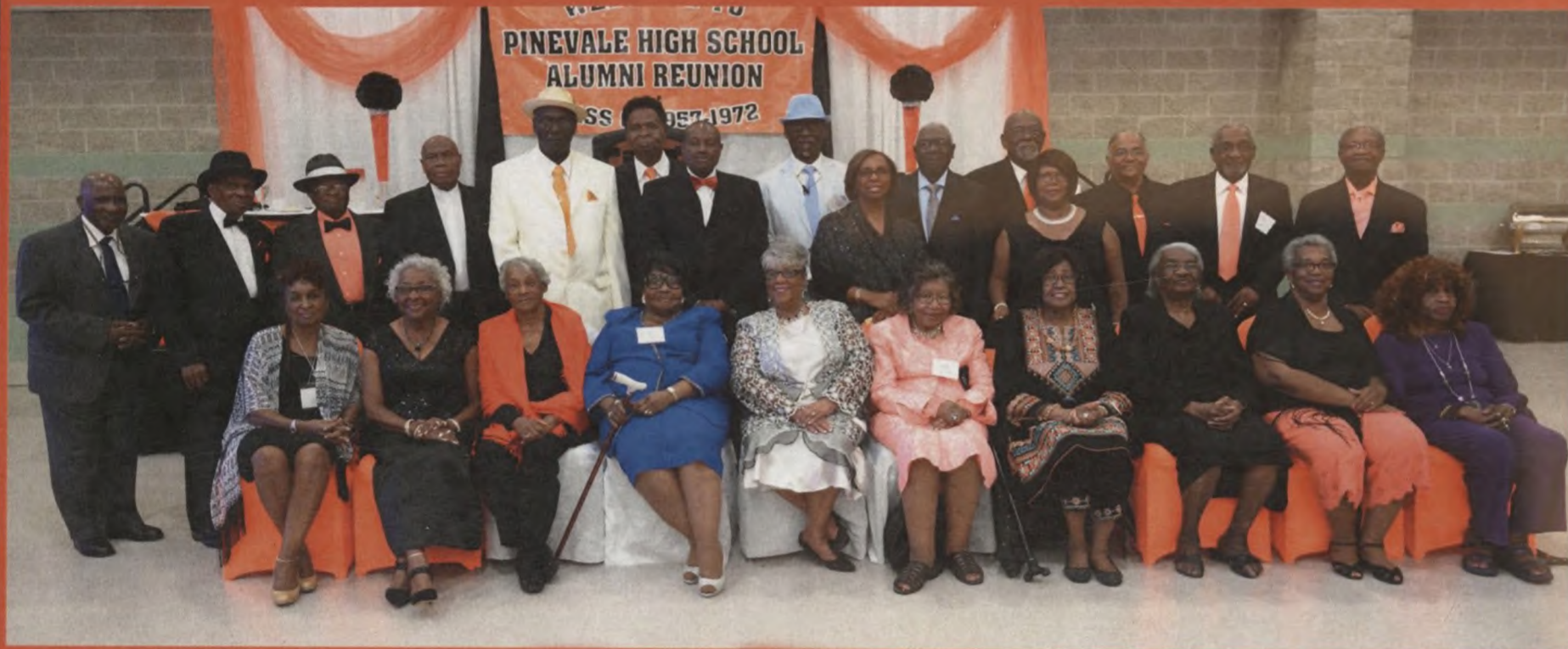
Pinevale Class of 1962