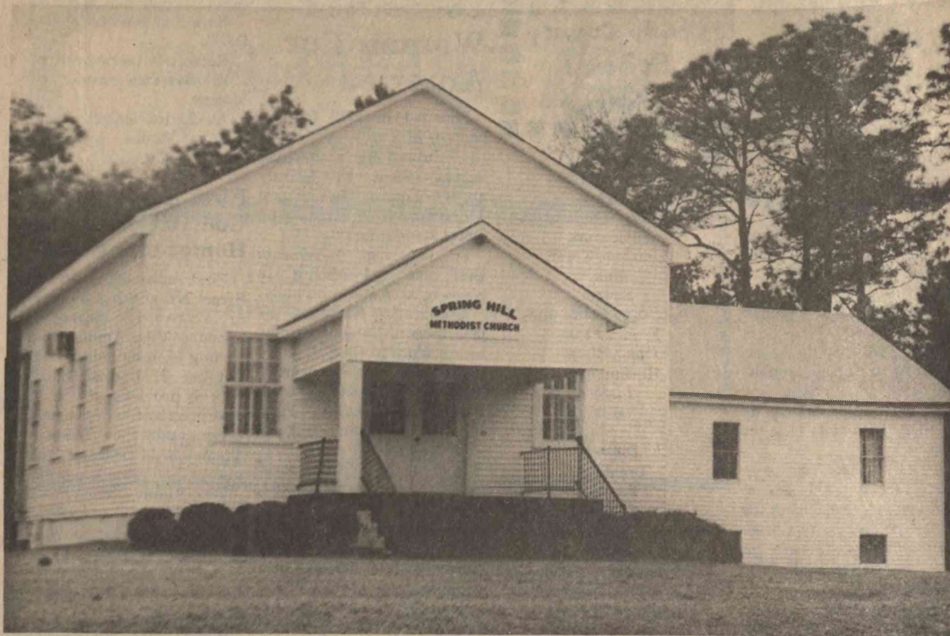
THE PRESENT SPRING HILL CHURCH, located approximately 8 miles north of Whigham and built around 1940 is the fourth building in which the congregation has worshiped since the church was founded well over one hundred years ago.