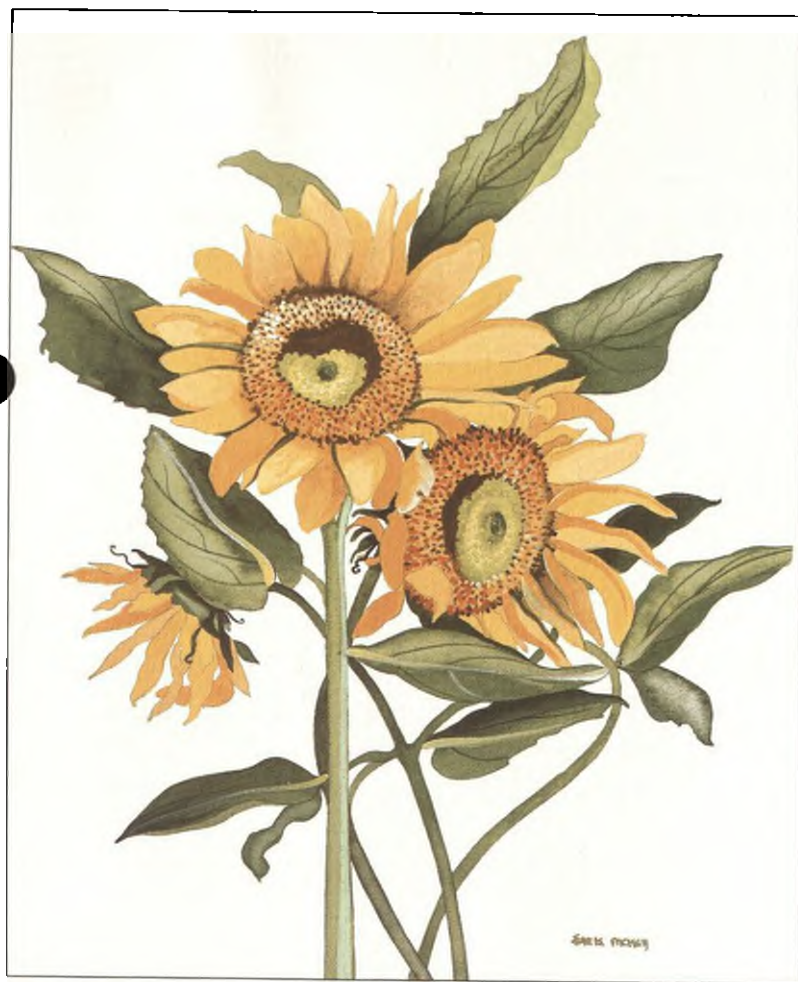
Return to my Roots