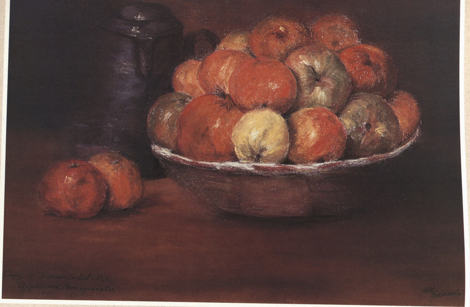
Copy of Gustave Caillebotte - Oil Apples and Pomegranates 1877