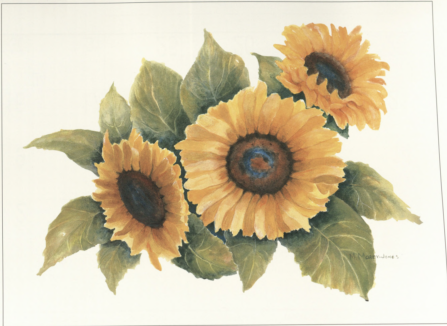
“Summer Sun II”