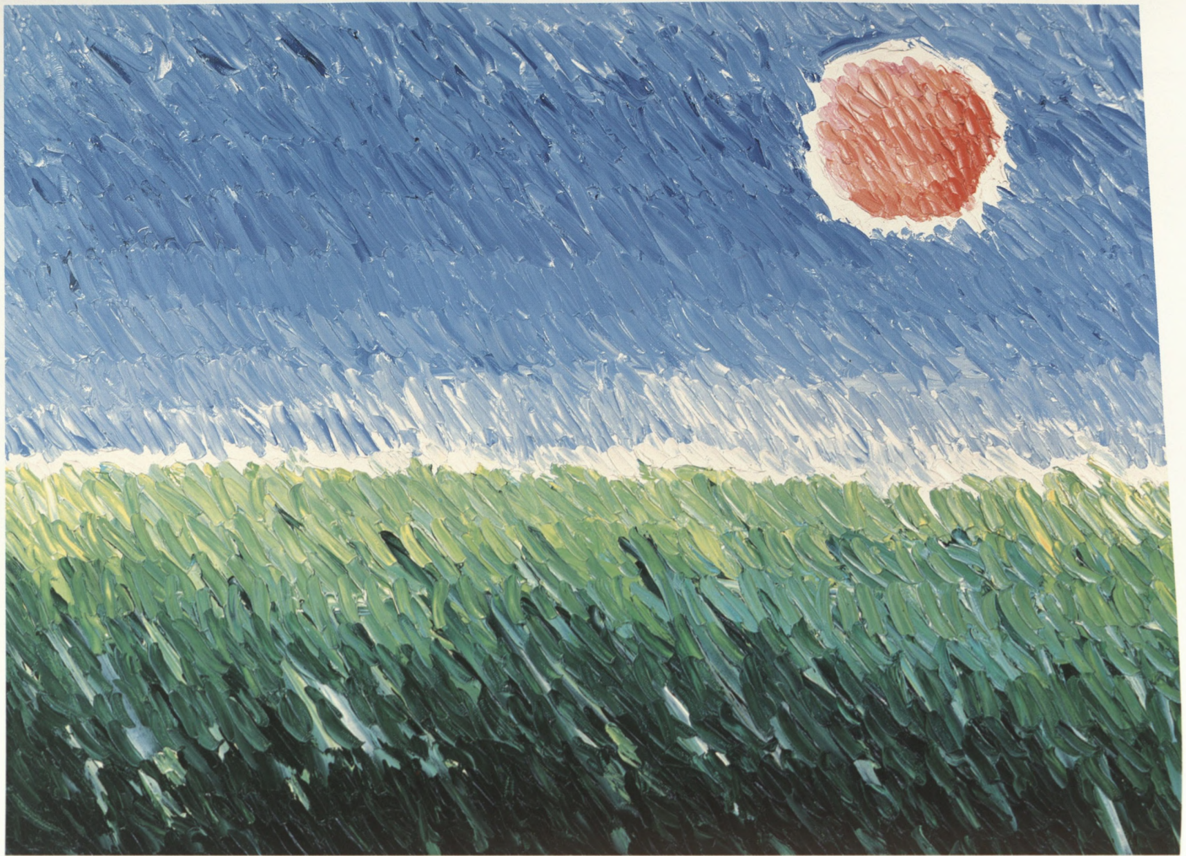
“Sunset Heaven and Fields”