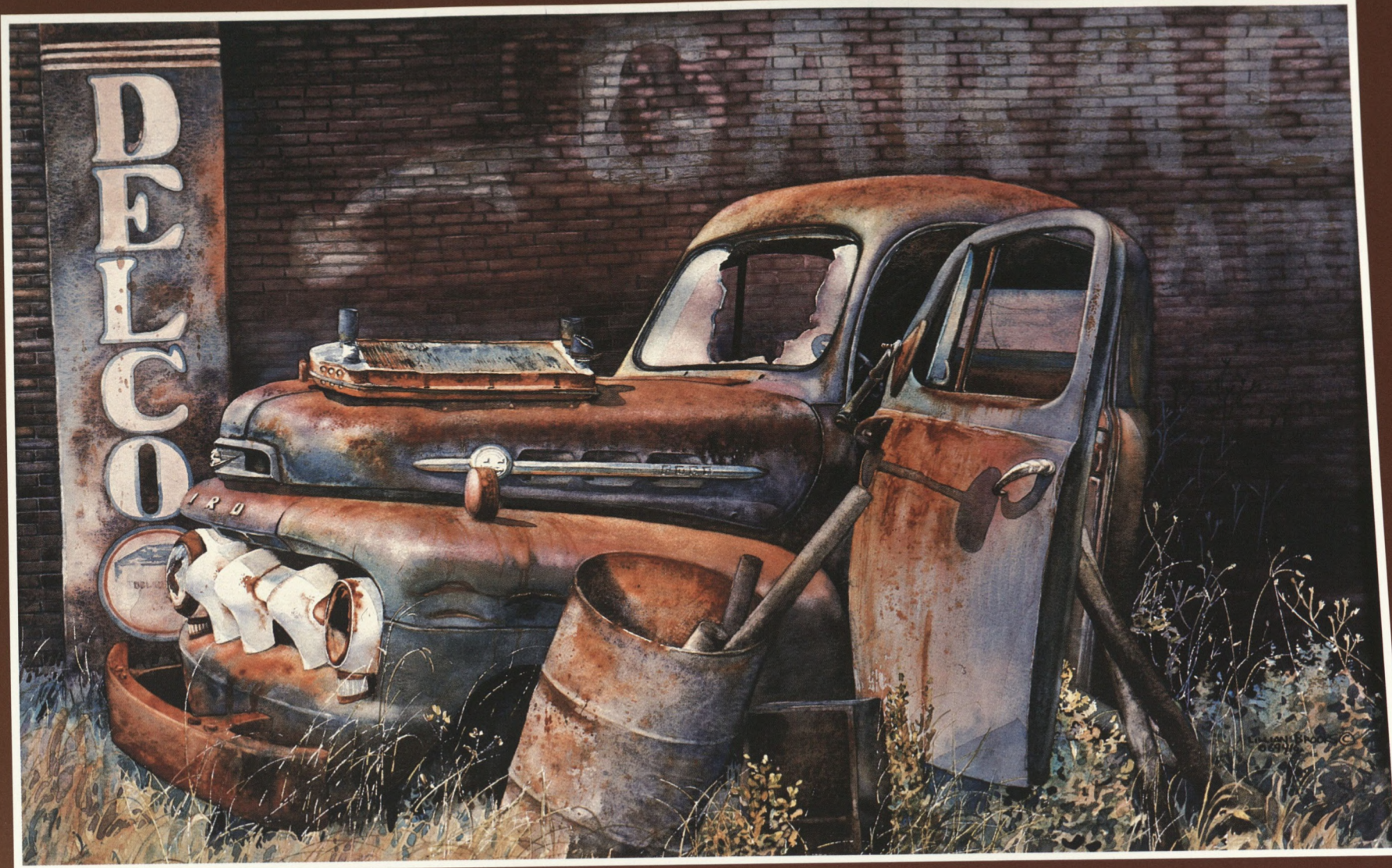
“Delco and Ford”