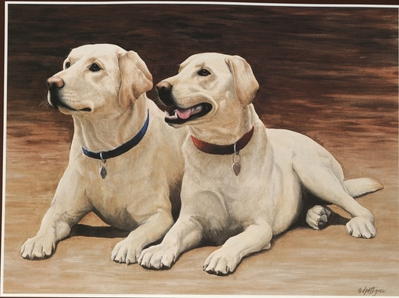
“Ajax and Echo”