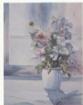
April "Spring Bouquet" Latrelle Ulrich