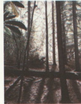
December "Cathedral" Margo Cline