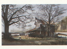
September "Posted" Lillian Brooks