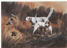
January "Quail Country" Eddie Norris