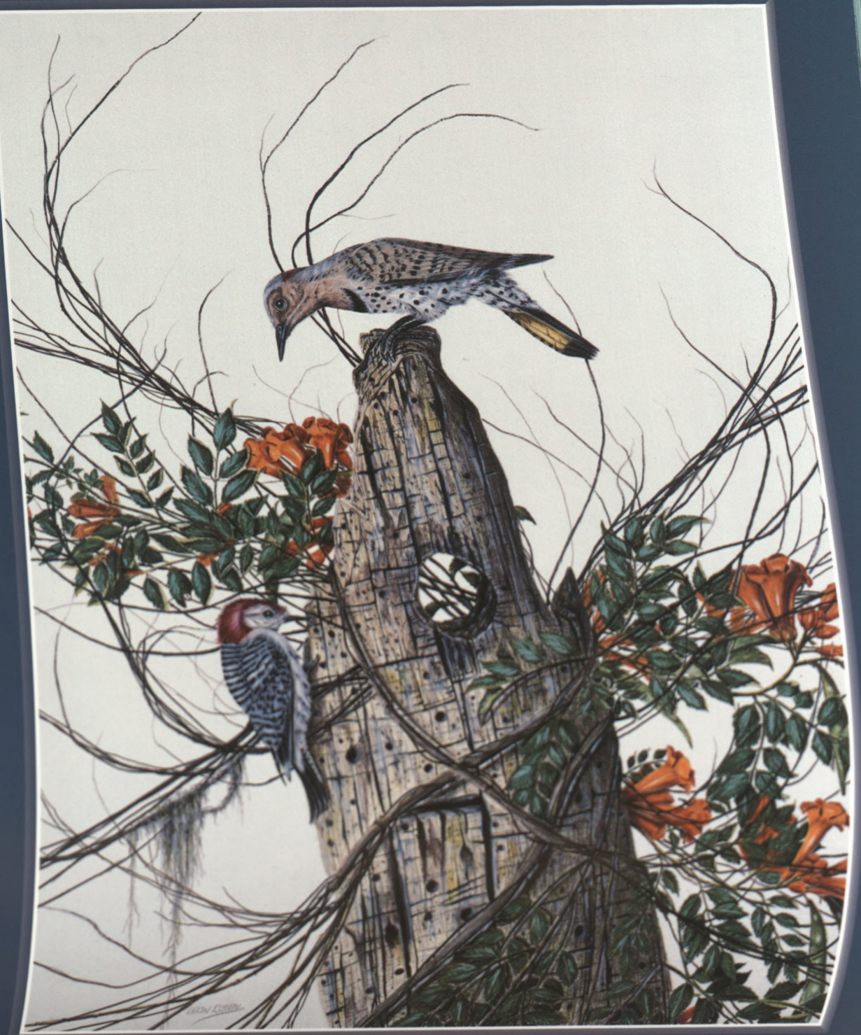
“Pecking Order” Leon Colvin