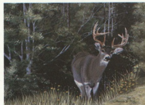
October "Okefenokee Whitetail" Marcia Fleteau