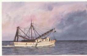
Front Cover "Heading Out" Don Pettigrew