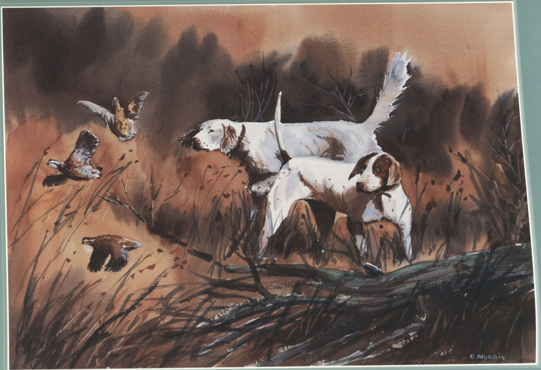
“Quail Country” Eddie Norris