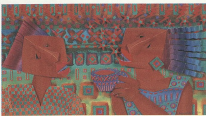
February 'Coffee Break' Beth Appleton