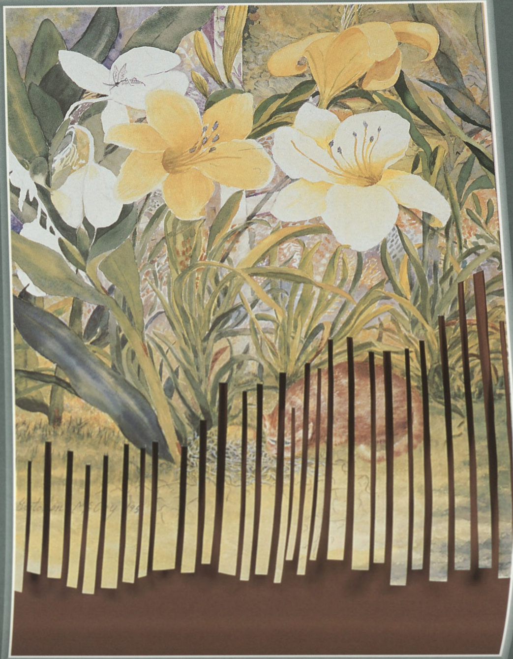
'Butterfly Lily' Gretchen McCoy