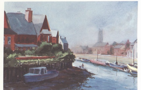
October 'English Riverbank' Eddie Norris