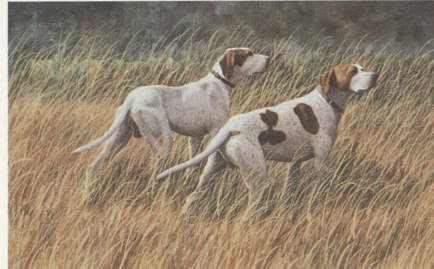
January 'Steady' Don Pettigrew