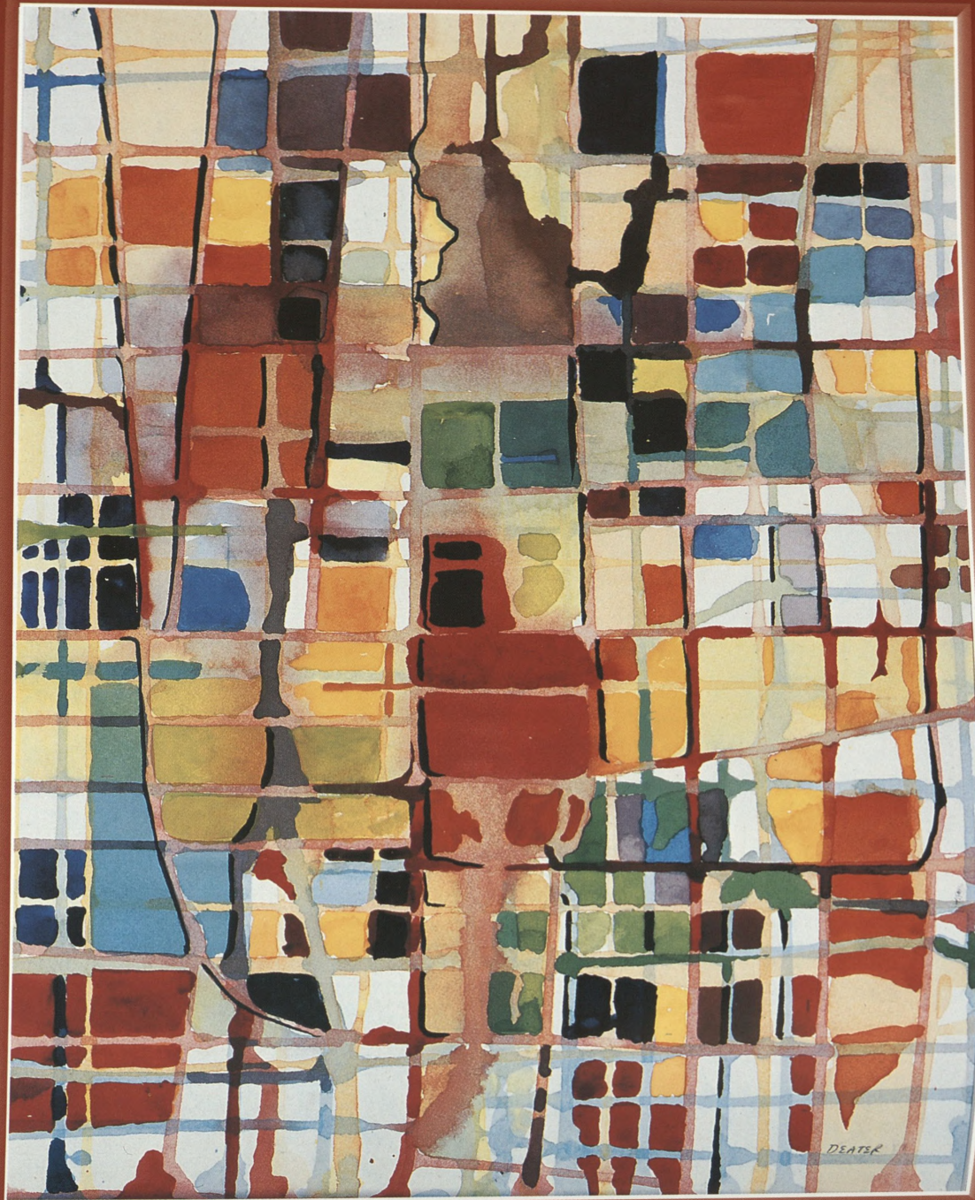
'Cross' Linda Deater