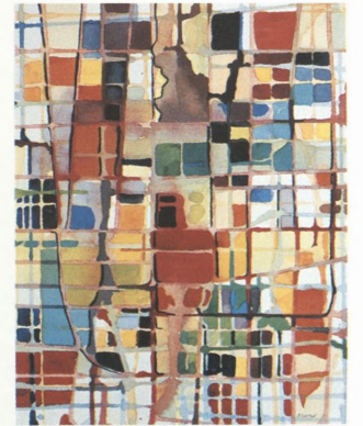
December 'Cross' Linda Deater