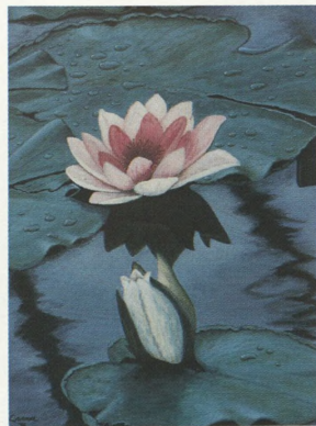
June 'Lilypads' Lavonne Orenstein