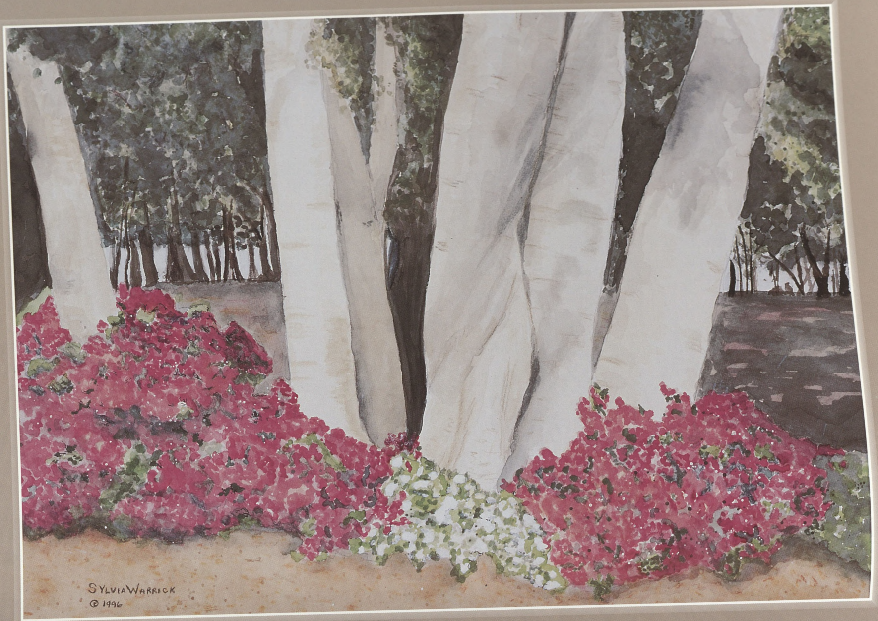
'Flowers at Honey Creek' Sylvia Warrick