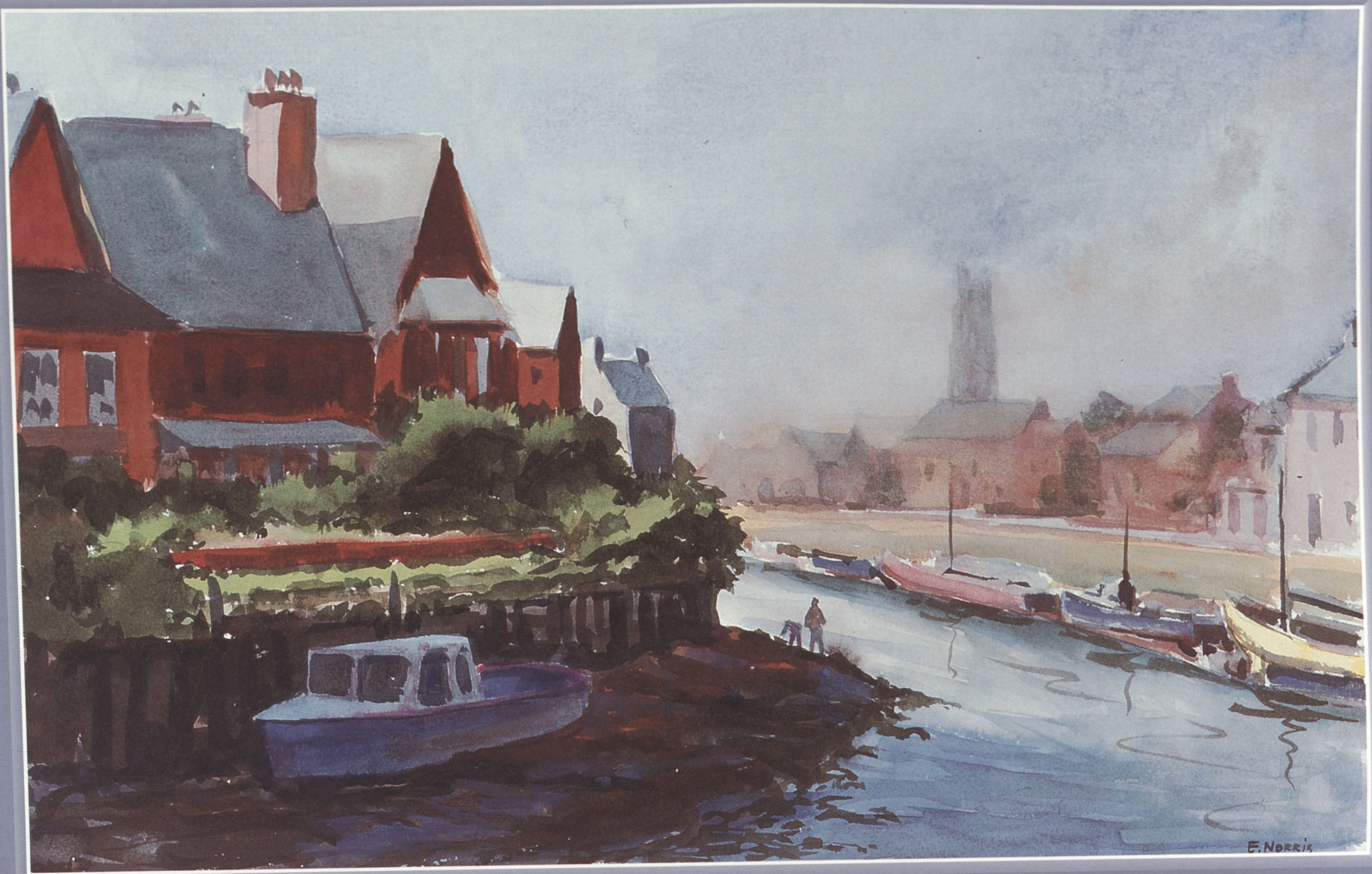
'English Riverbank' Eddie Norris