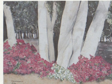
September 'Flowers at Honey Creek' Sylvia Warrick