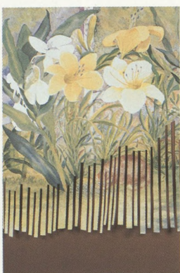
March 'Butterfly Lily' Gretchen McCoy