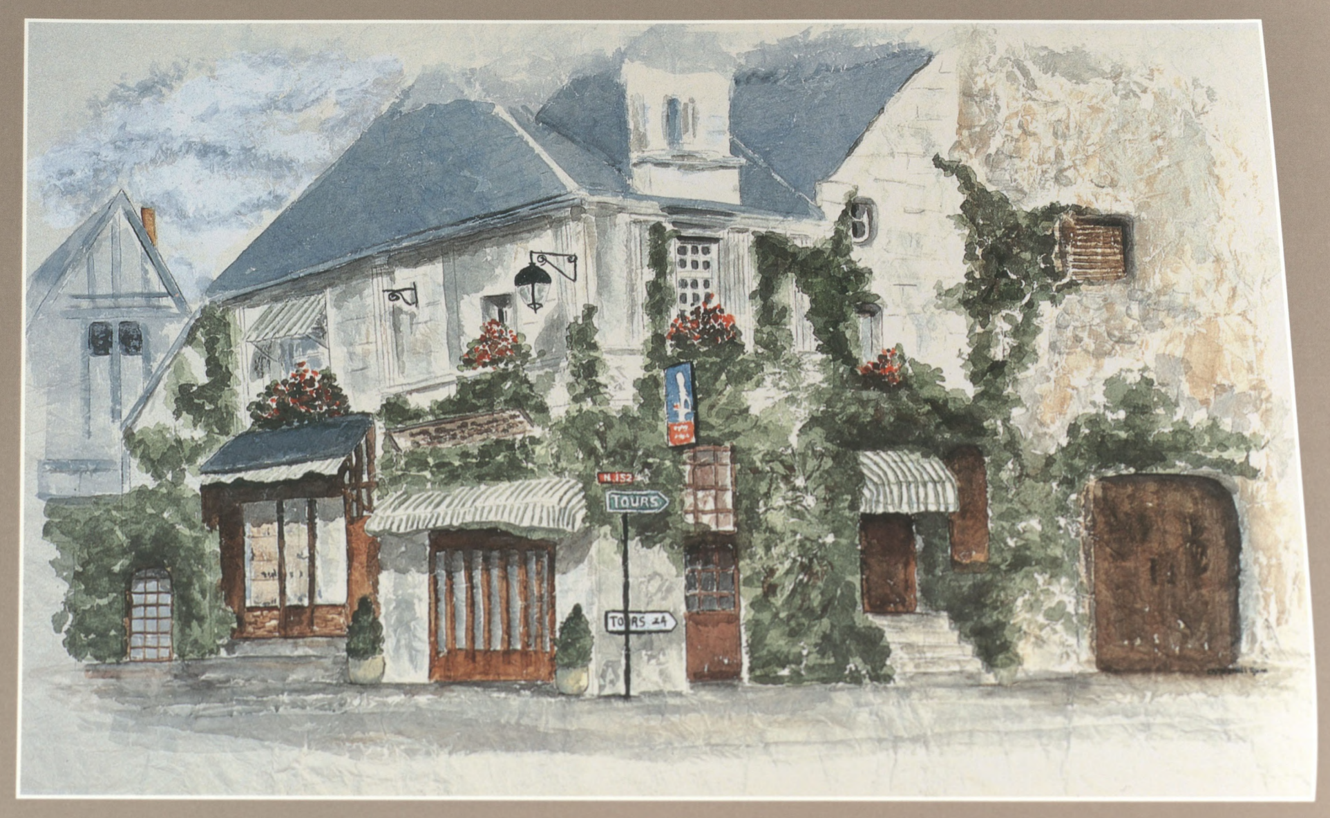
"Road to Tours" Carol Hall Gum