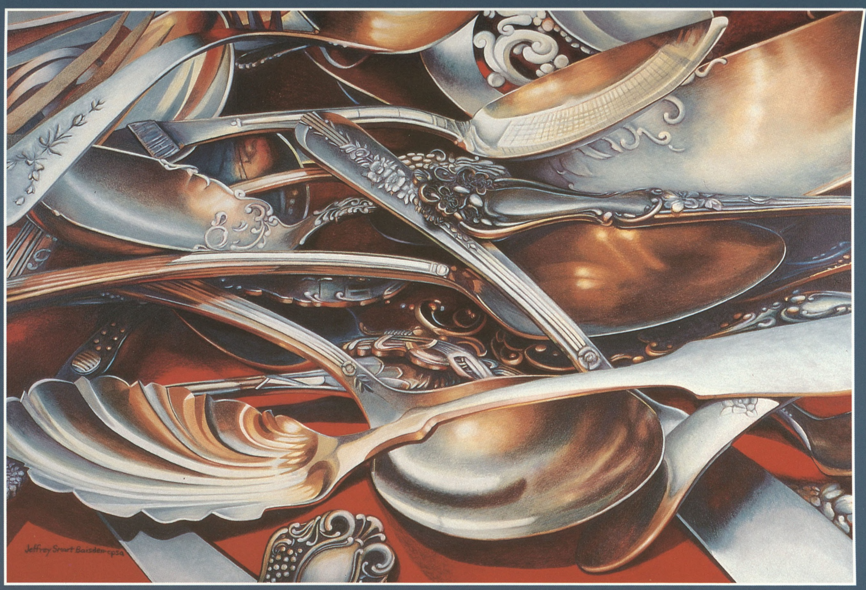
"Silver Linings" - Jeffrey Smart Baisden