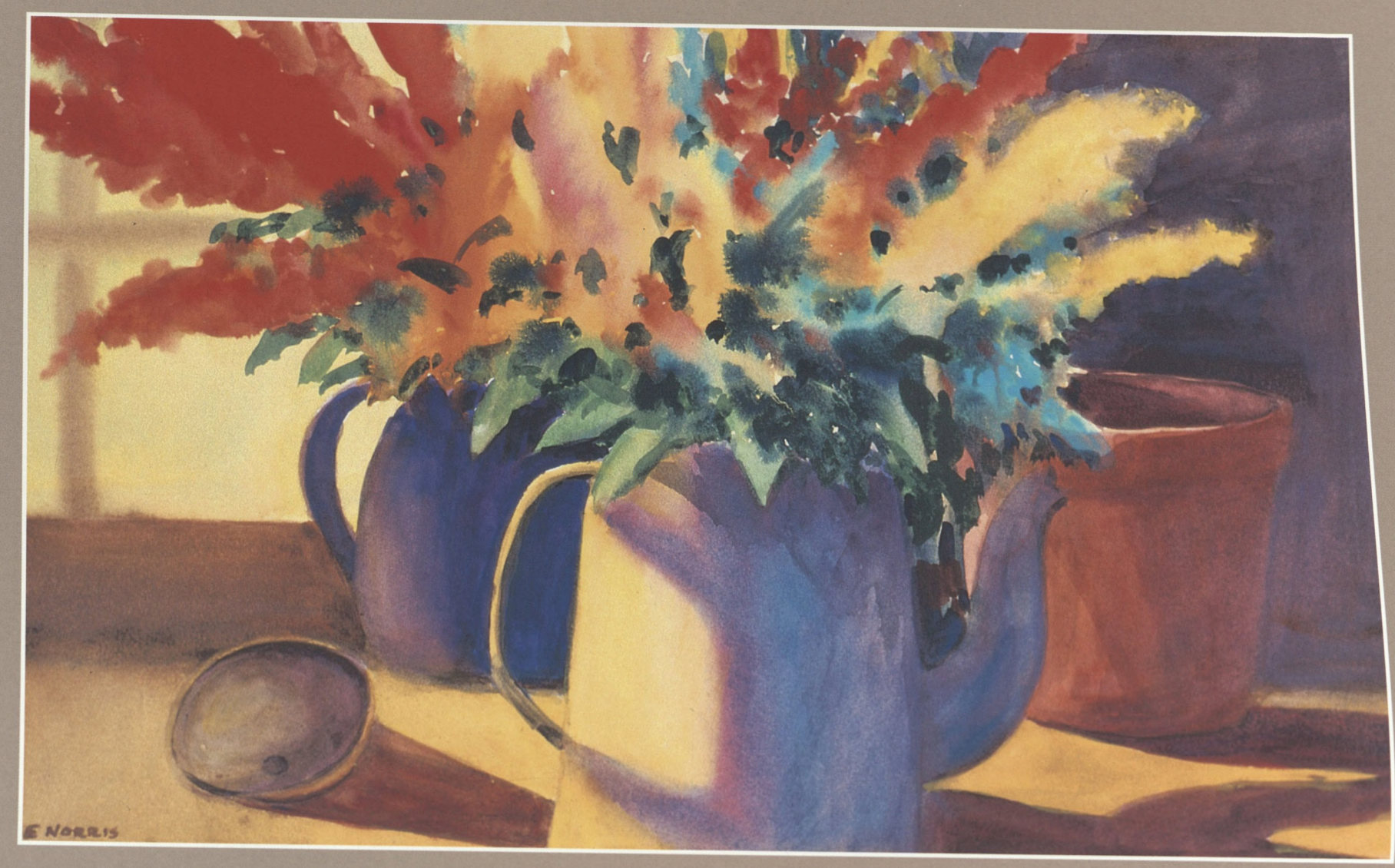
"Butterfly" Eddie Norris