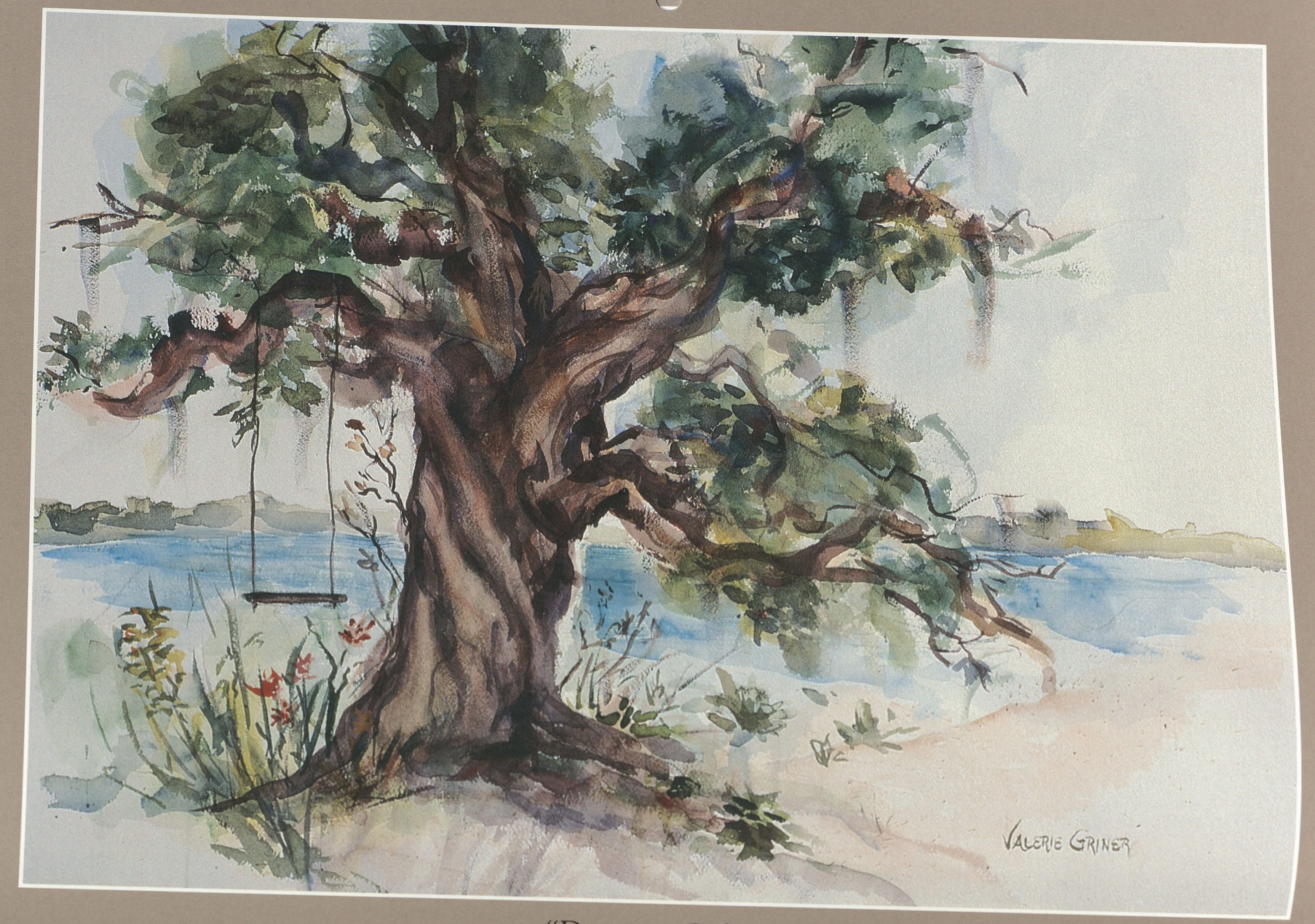
"Dancing Oak" Valerie Griner