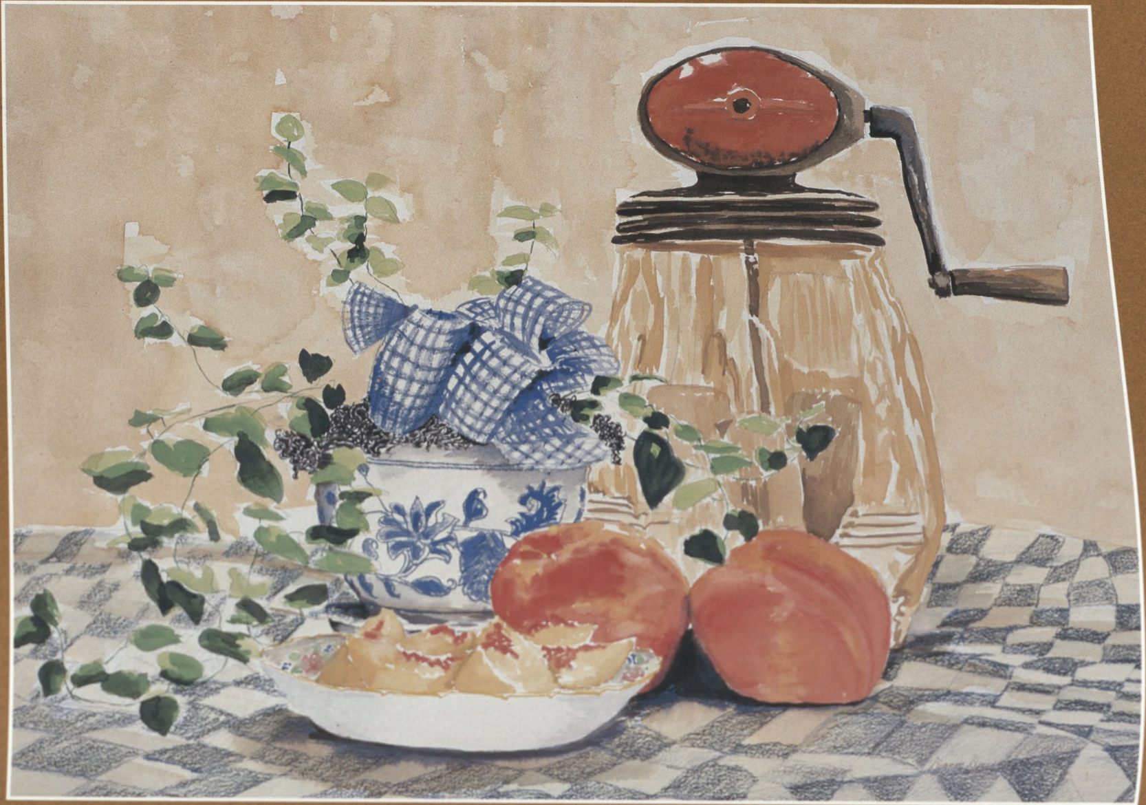
Granny's Butler's Churn