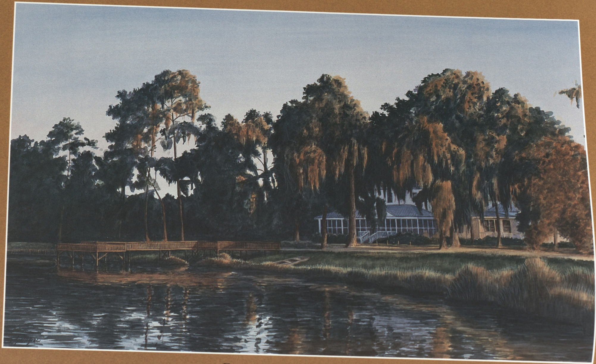
Evening At Ocean Pond Don Pettigrew