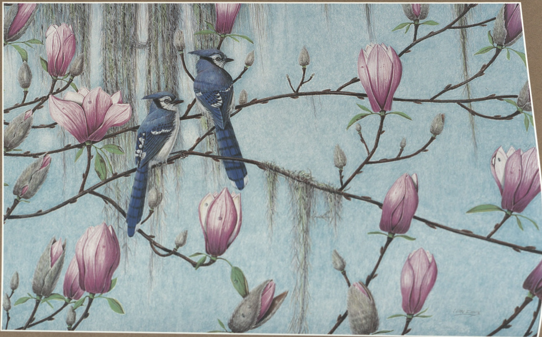
Blue Spring Leon Colvin