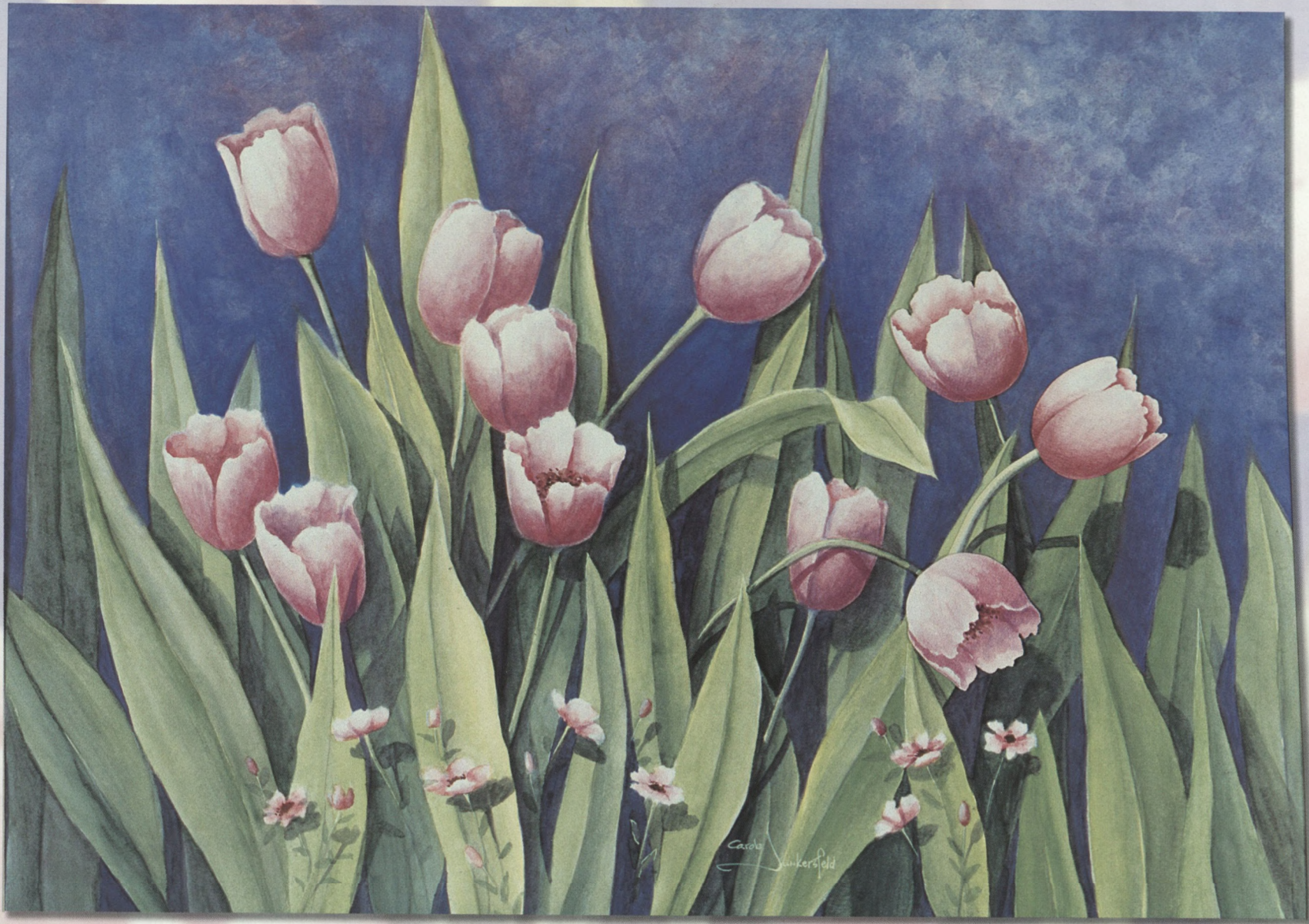
Spring Influence Carole Junkersfeld Live Oak, FL