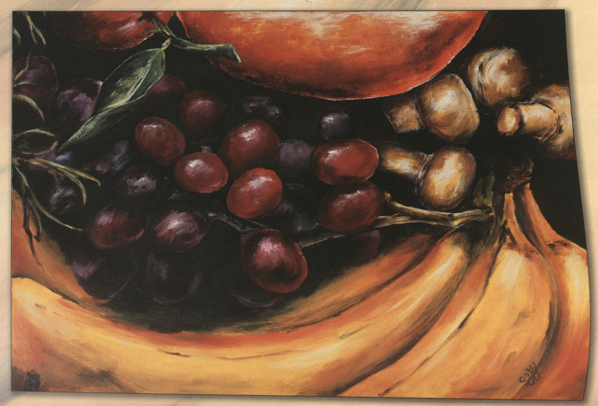
Sensational Flavor Coby Browning