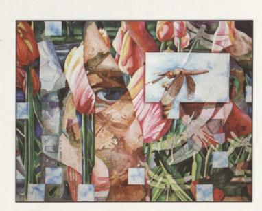
Moments of Clarity by Clint Samples