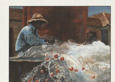
January Net Repairs by Scott Lamp