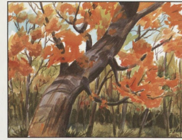
November Crooked Tree by Duane Ellifritt