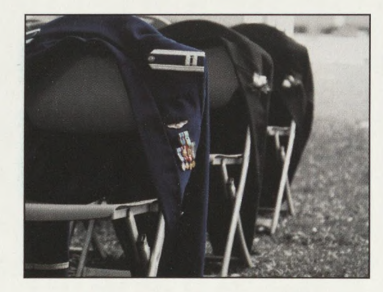
Front Cover Untitled #167 by Wes Sewell