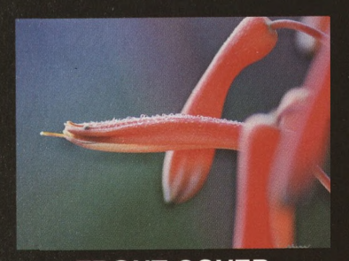
FRONT COVER Bait N Switch by Marsha Pokorny LEE. FLORIDA