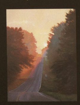
OCTOBER Speed of Light by Rani Garner