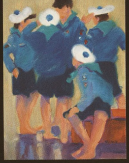
JUNE French Sea Scouts