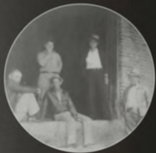
Senior Staff circa 1935