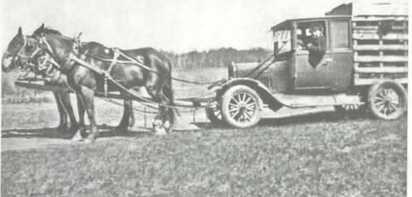
Hoover truck c1937