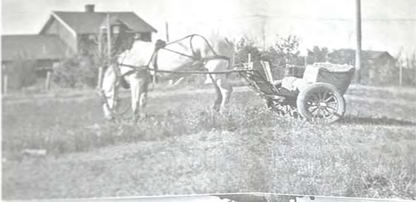
Genuine hoover cart using only back portion of the body 1932