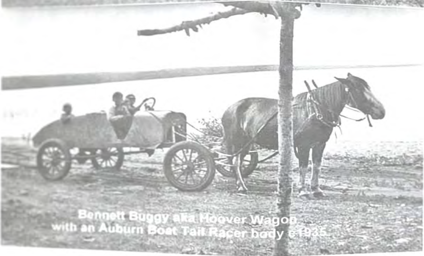
Bennett Buggy aka Hoover Wagon with an Auburn Boat Tail Racer body ©1935