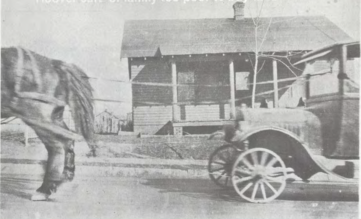
Hoover wagon Model T Ford chassis c1932