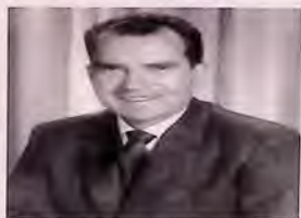
RICHARD NIXON – PRESIDENT OF USA