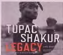
BORN JUNE 16 TH , 1971