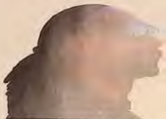
"SNOOP DOGG" BORN OCTOBER 20, 1971