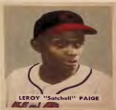
1 ST BLACK FROM NEGRO LEAGUE INDUCTED INTO HALL OF FAME