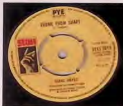
TOP BILLBOARD SONG OF THE YEAR