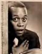
"FLIP WILSON" MOST POPULAR TV SHOW