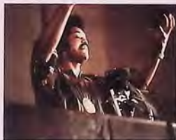
OPERATION "PUSH" FOUNDED BY JESSEE JACKSON