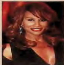
1 ST BLACK MODEL ON COVER OF MAJOR US PUBLICATION - "GLAMOUR" MAGAZINE