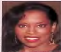
ACTRESS REGINA KING BORN 1/15/1971