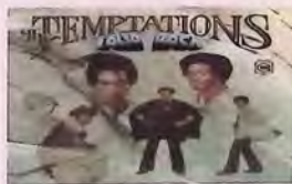
"JUST MY IMAGINATION" #1 ON BILLBOARD