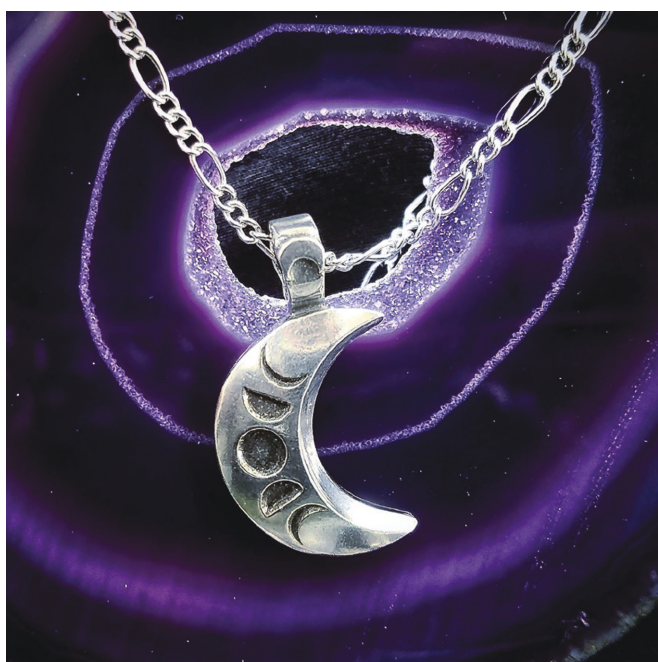
A necklace with a Phases of the Moon design. The Moon is a powerful symbol for intuition.

Sigils are very simple drawings – a very minimal approach that expresses the essence of the symbol to you, powerfully and directly.