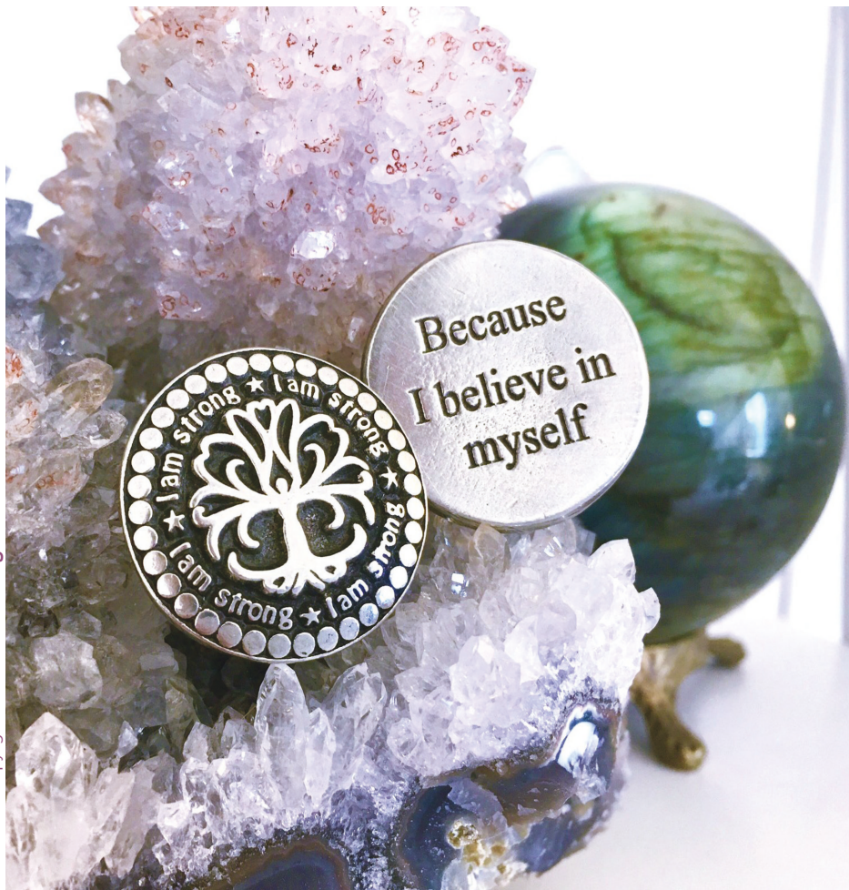
Text & Photos copyright © 2020 DevaDesigns

The first question to ask yourself is: What represents resilience for you? The natural world is a great source of inspiration for sigils. Consider what plants or animals have qualities that inspire thoughts of resilience in you. Brainstorm multiple ideas, and then consider each one and what they represent to you. It’s often easier to identify 3 possible symbols to begin with, and then spend time with each to determine which one works best for you.