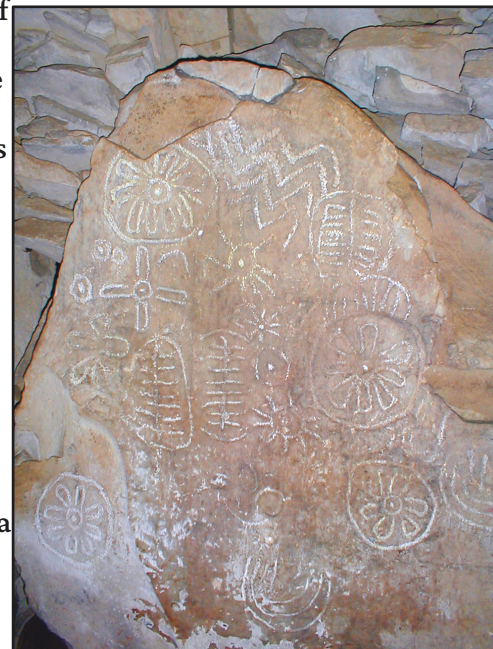
Figure 3 Sun symbols on the backstone at Cairn T at Loughcrew.